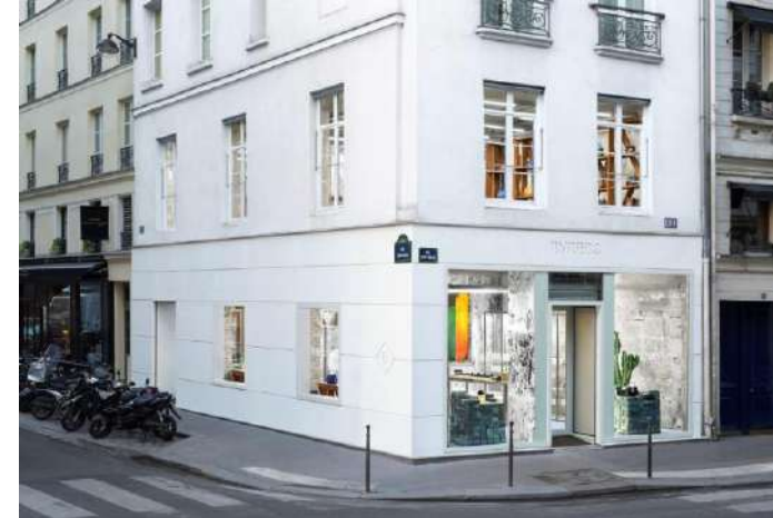
Paris Saint-Honore flagship

BYREDO is distributed in 40 countries through standalone and select wholesale doors