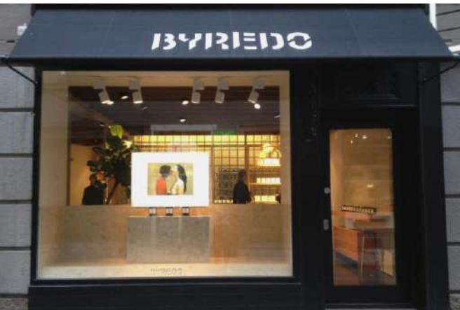
Stockholm MS6 flagship

BYREDO is distributed in 40 countries through standalone and select wholesale doors