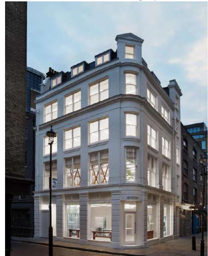
London Lexington flagship