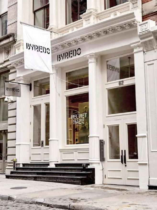
New York Wooster flagship