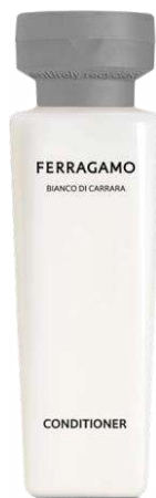
50 ml JFE58044

A lightweight formula to untangle and protect, leaving the hair lightly scented.