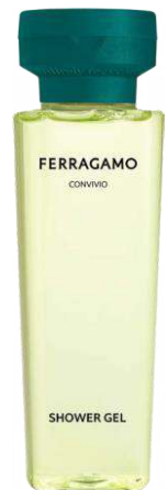
50 ml JFE58482