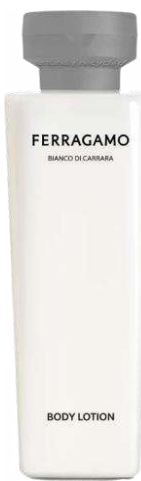
85 ml (Production with MOQ) JFE58092