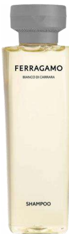
85 ml (Production with MOQ) JFE58045