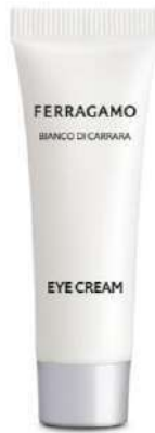
Eye Cream 10 ml JFE58036