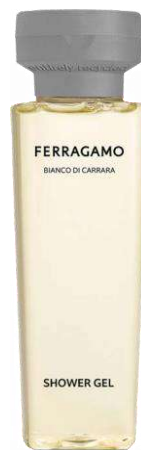
50 ml JFE58042