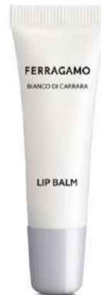
Lip Balm 10 ml JFE58062