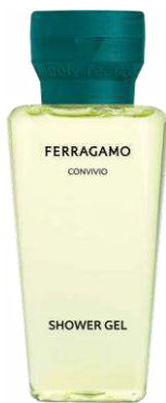
33 ml JFE58452