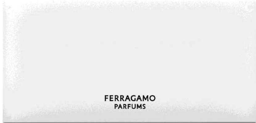
Tray 25x12 cm JFE58890