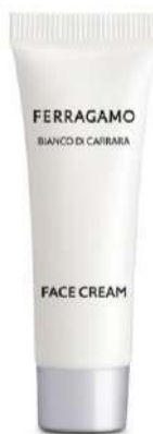
Face Cream 10 ml JFE58063