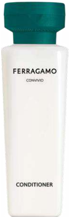
50 ml JFE58484