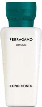
33 ml JFE58451