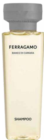
50 ml JFE58039

A lightweight shampoo for shiny silky hair.