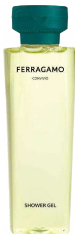
85 ml (Production with MOQ) JFE58486