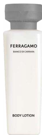
50 ml JFE58043