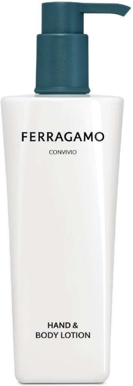
Hand & Body Lotion