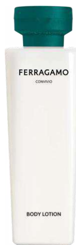
85 ml (Production with MOQ) JFE58487