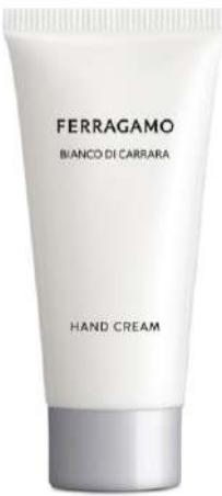
Hand Cream 30 ml JFE58035