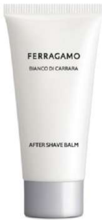
After Shave Balm 30 ml JFE58064