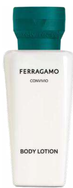
33 ml JFE58453