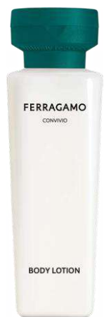
50 ml JFE58483