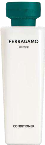
85 ml (Production with MOQ) JFE58488